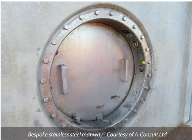
Bespoke stainless steel manway