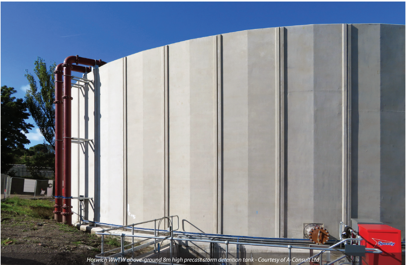
Horwich WwTW above-ground 8m high precast storm detention tank

Advance-plus, a joint venture between MWH Treatment, J Murphy & Sons and Stantec UK, are currently delivering a project at Horwich WwTW on behalf of United Utilities. The project is required to deliver the Environment Agency's Water Industry National Environment Programme (WINEP) and takes into consideration future population growth based on a 2035 design horizon. The requirements for the project are to achieve a final effluent quality of 0.25 mg/l of total phosphorus on an annual average basis and a final effluent quality of 2.5 mg/l iron on a 95%-ile basis and 8 mg/l iron on a upper tier limit basis. The work will ensure the local River Douglas will achieve a good status under the Water framework directive.