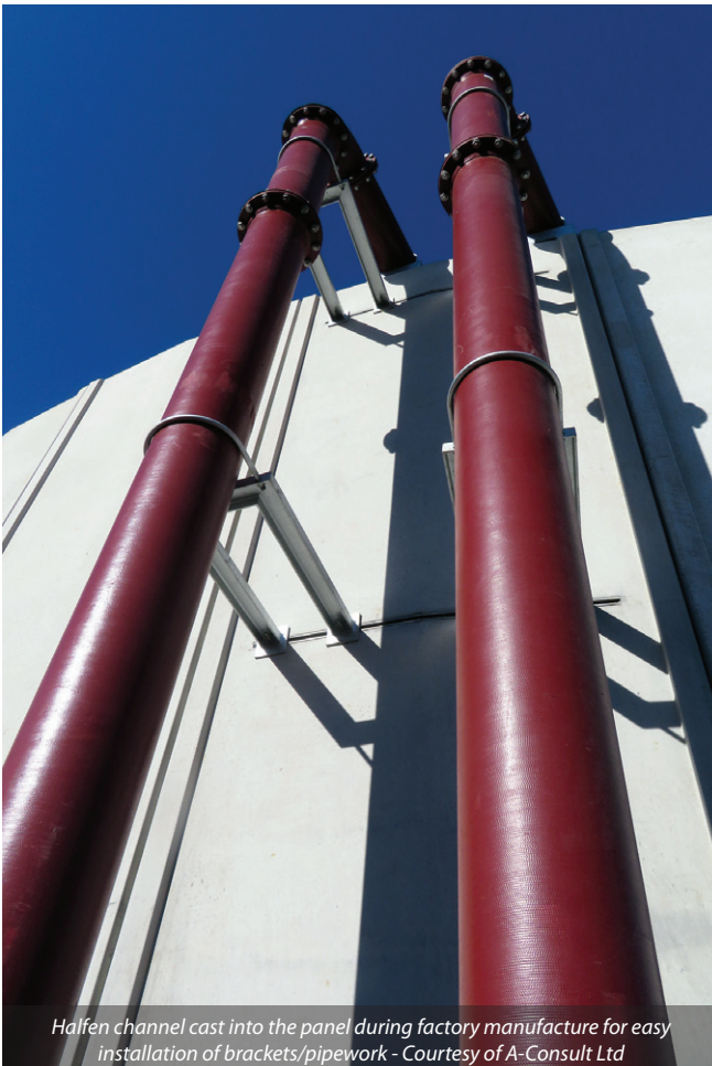
Halfen channel cast into the panel during factory manufacture for easy installation of brackets/pipework